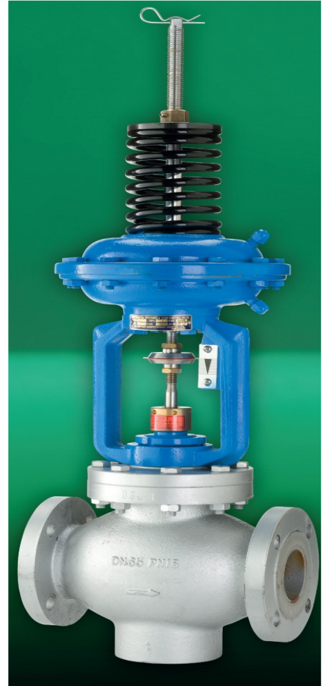
Differential Pressure Control Valve DP971F- Sizes: DN65 – DN150