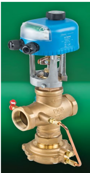
D991- Sizes: DN40 & DN50