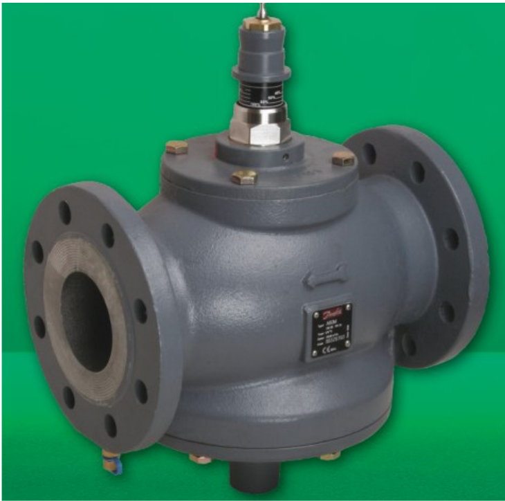
DPIC991F- Sizes: DN50 – DN250