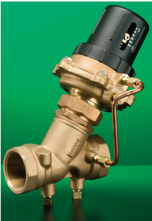
Differential Pressure Control Valve DPAF961-Flow & DPAR961-Return Balancing Valve

To meet the growing use of variable speed pumps for HVAC applications, Crane Fluid Systems has launched a range of Differential Pressure Control Valves (DPCV) specifically aimed at optimizing system performance.