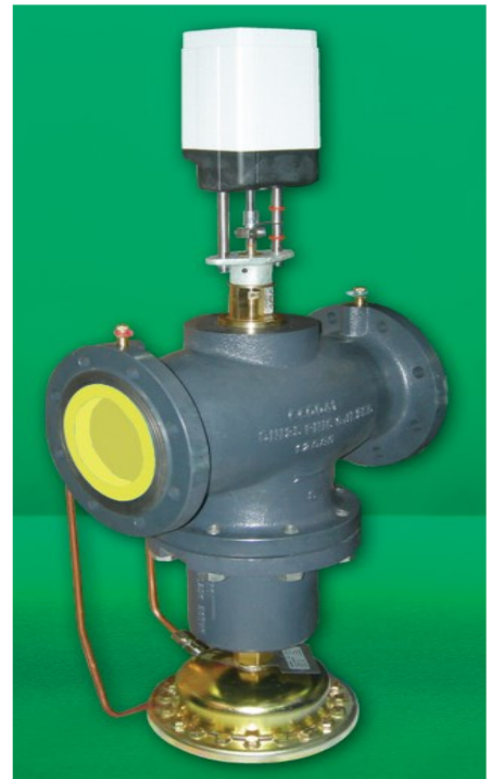
DPIC991F WITH Actuator Available Sizes: DN50 – DN250